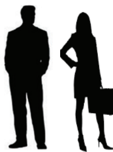
Total Image Consultation

MIRAMONTE HOTEL 45000 Indian Wells Lane, Indian Wells 3:00 pm to 5:00 pm Florentine Ballroom