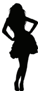
Liquid Facelift: Non-Surgical Natural Results