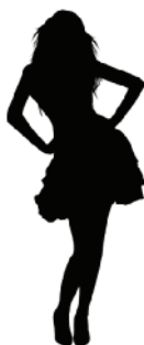
Liquid Facelift: Non-Surgical Natural Results